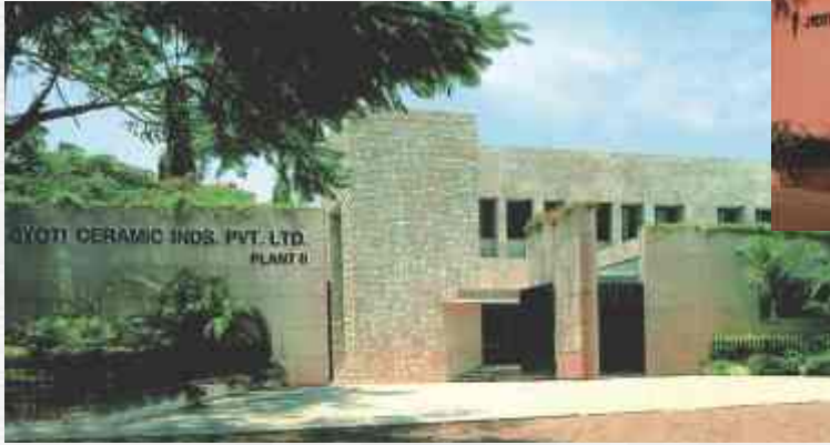
Plant - II Estd. 1992