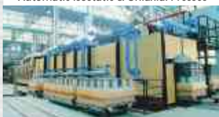
High temp. Tunnel Kiln