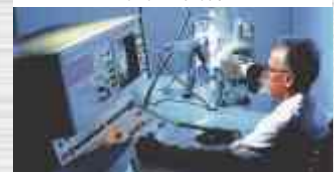
S. E. M.