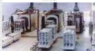
Battery of High temp. Kilns