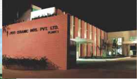
Plant-I Estd. 1970