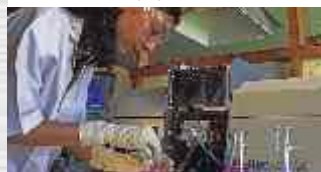
A. A. S.