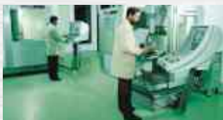
CNC Milling & Machining