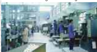
Automatic Isostatic & Uniaxial Presses